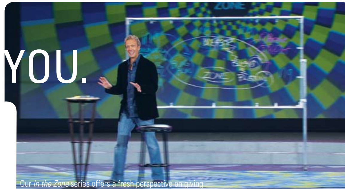
Our In the Zone series offers a fresh perspective on giving

Pastors across the country have taken ideas from CreativePastors, added their own unique spin, and experienced phenomenal results. Here's just one example from a church that used our In the Zone series to teach about giving: